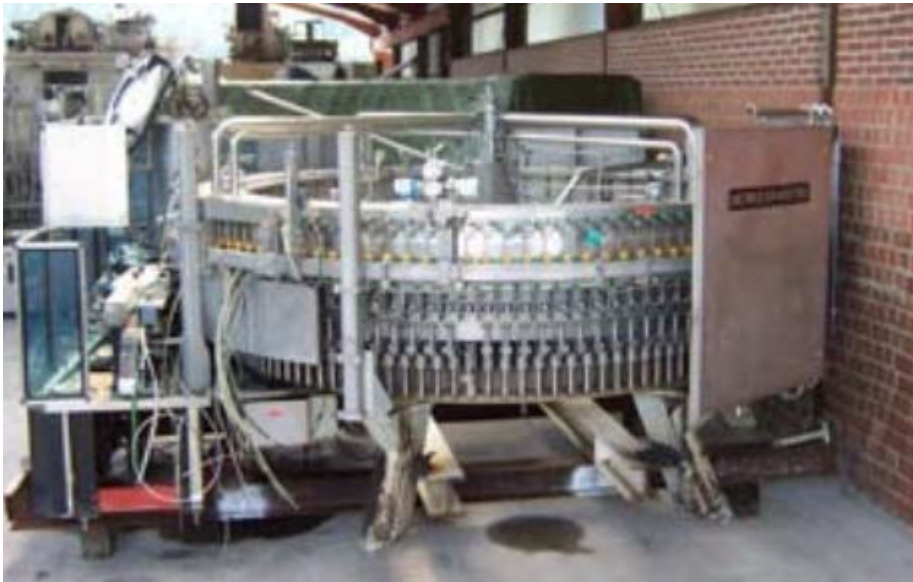
Rotating filling machine