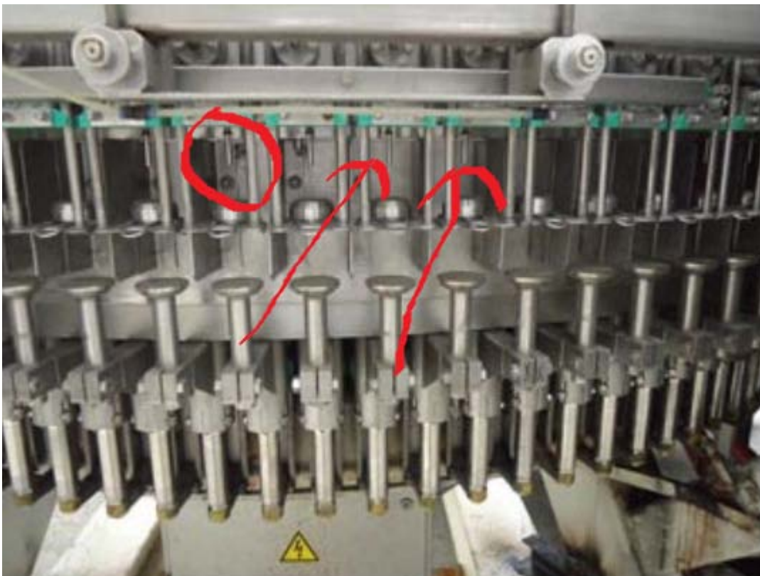
In the rotating machine, the filling nozzles - marked red - can fall into the bottle.